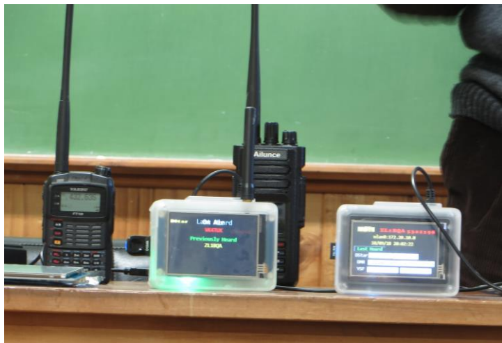
Above: Yaesu and Ailunce handheld transceivers and their hotspot hardware.

The meeting on 18 September was treated to a live demonstration by Ted ZL1BQA and Steve ZL1TZP. A variety of digital handheld radios and their hotspots were demonstrated. The hotspots were all home built, with Raspberry Pi processors. Most hotspots had their own small full colour display screen to show the current status of the channel. All hotspots were wirelessly connected to the